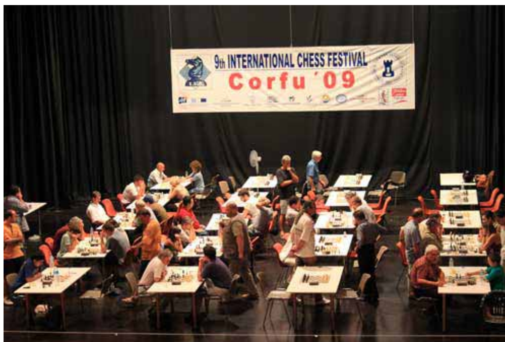
CORFU CHESS FESTIVAL 2009